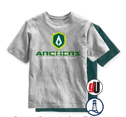
Gray or Green Archers T-Shirt