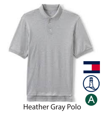
Boys Regular • Any Dress Uniform piece or