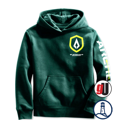
Green or Black Archers Sweatshirt