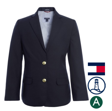
Navy Blue Blazer