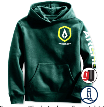
Green or Black Archers Sweatshirt