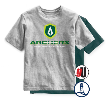
Gray or Green Archers T-Shirt